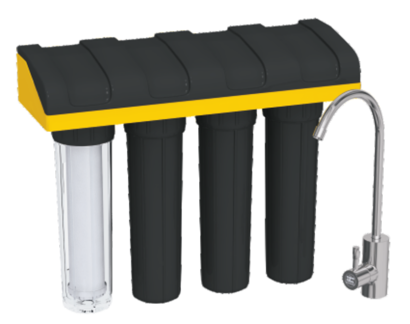
Cartridge set for EKOFP4-SLIM-UF EKOFP4-SLIM-UF-CRT